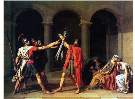
What is the FUNCTION of this art work?