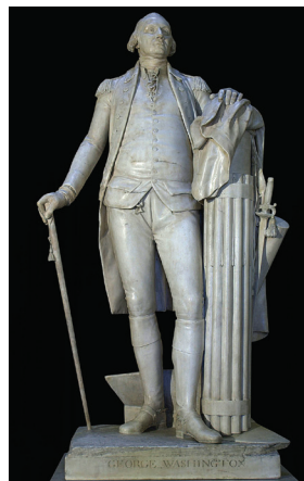
George Washington Jean-Antoine Houdon